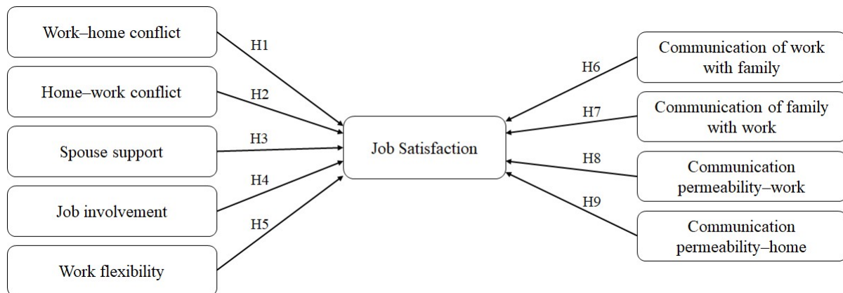
Figure 1: Conceptual framework

Therefore, the literature highlights the multidimensionality of the work-life balance and the necessity of a comprehensive empirical study of these variables in describing job satisfaction among women working in the financial sector, especially in terms of localized socio-cultural background (like Bilaspur city). According to the hypothesis formulated above, the study has come up with the following conceptual framework (fig 1).